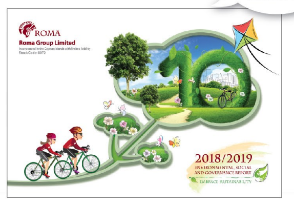
Environmental, Social and Governance Report 2018/2019

We look forward to achieving more together in the years ahead.